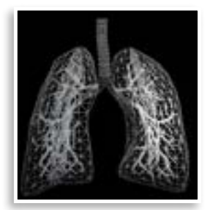
A video still of lung structures developed through tissue engineering.