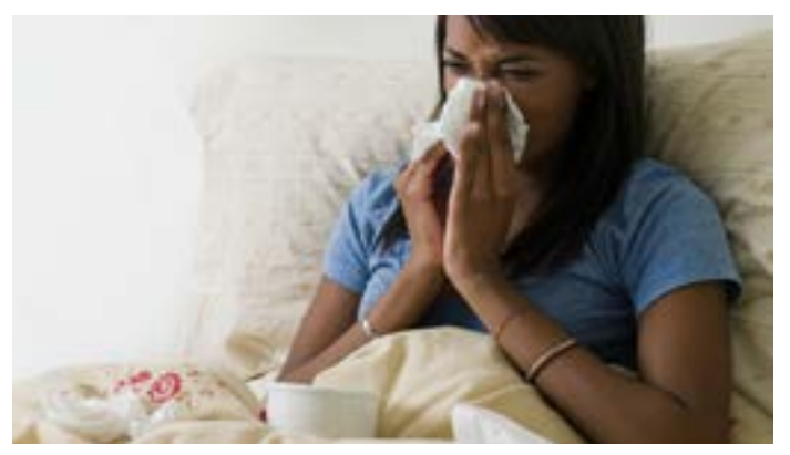
Once the body fights off a virus, like a cold, it retains some disease-fighting cells.